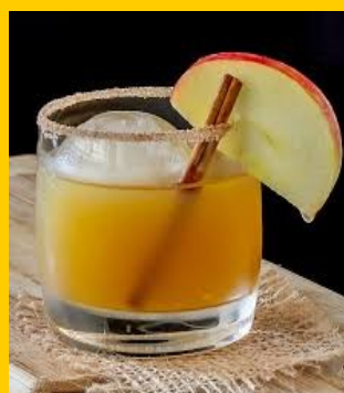
Bourbon Apple Cider Cocktail

*Bourbon *Apple Cider *Lemon Juice *Cinnamon/Sugar Rim *Apple Slice Decor