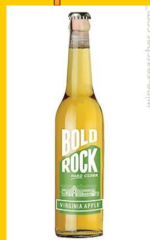
Bold Rock Apple Cider

*Bourbon *Apple Cider *Lemon Juice *Cinnamon/Sugar Rim *Apple Slice Decor